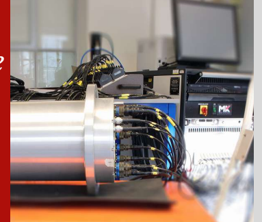
Sub-Assembly Test and measurement of slip rings at subassembly stage in the manufacture of drones, periscopes, wind turbines, medical instrumentation, and defence applications